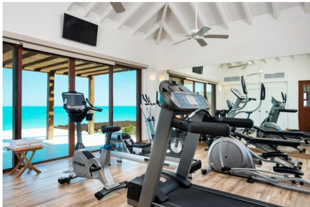
A newly built pavilion adds a popular amenity for your guests - a fully equipped state-of-the-art fitness center that captures the stunning, uninterrupted views.