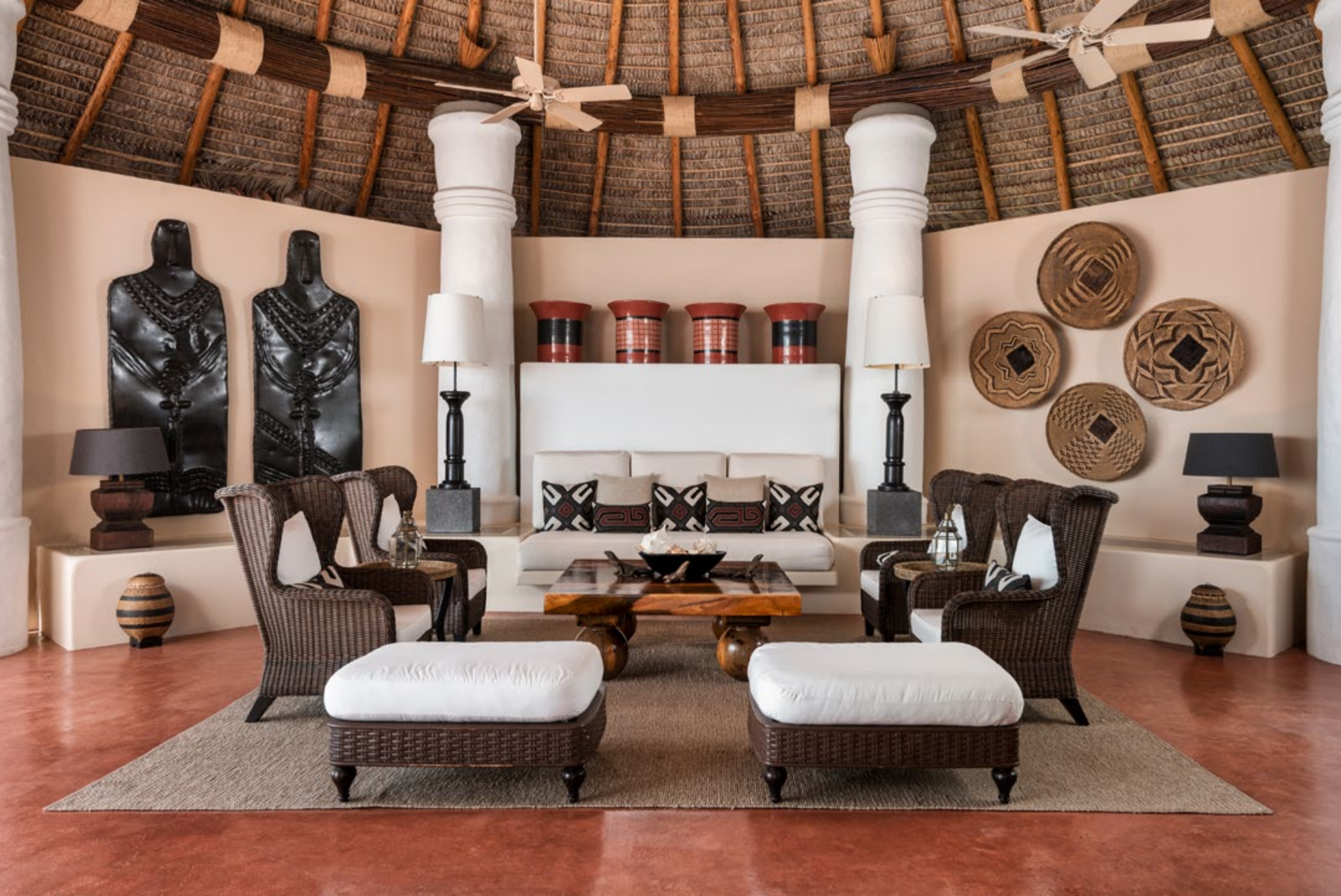
Gracing the cover of Architectural Digest when it was built in 2005, Bajacu is designed by renowned architect Marco Adalco, an AD Top 100 Architects best known for his technical mastery of scale, color and materials. A Caribbean masterwork, Marco Adalco said "I work with eternal materials and try to collaborate with nature to create vivacious designs."